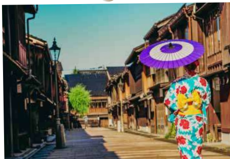
东茶屋街 Higashi Chaya Street