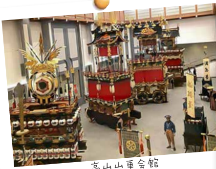
高山山車會館 Takayama Floats Museum