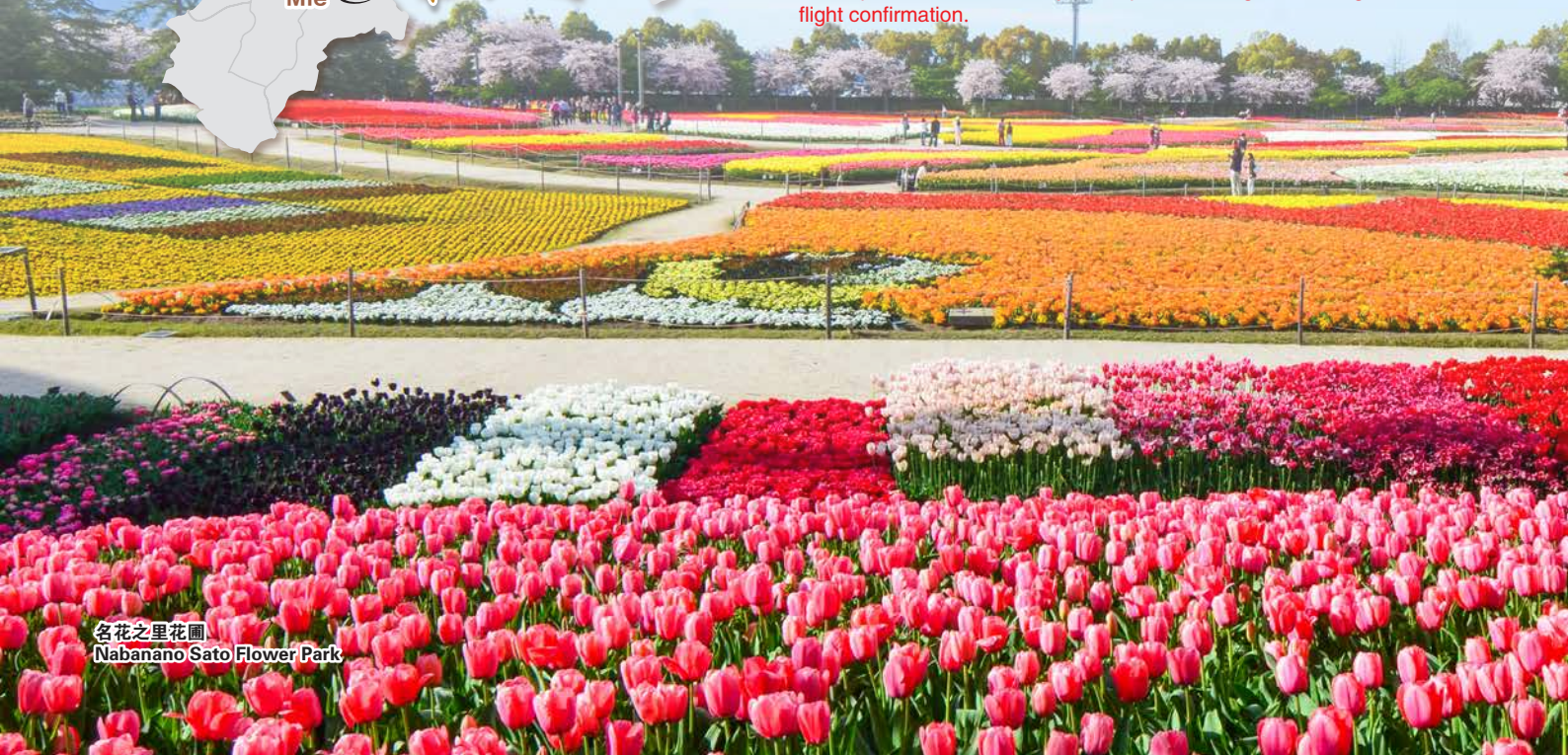
名花之里花園 Nabanano Sato Flower Park

※ Sequence of the itinerary is subject to change according to the final flight confirmation.