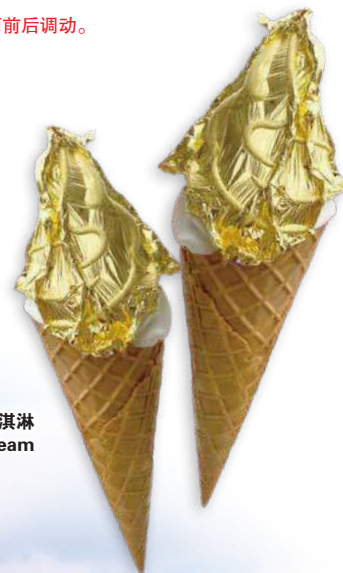
金箔冰淇淋 Golden leaf ice-cream