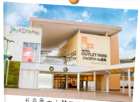
长岛爵士之梦三井Outlet Nagashima Jazz Dream Mitsui Outlet