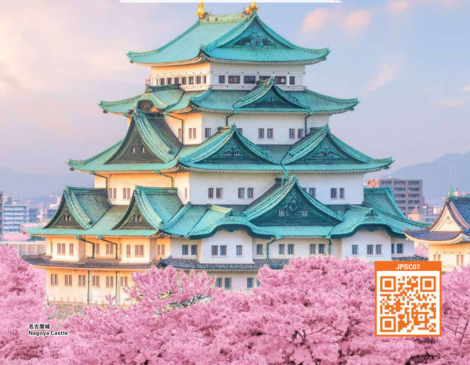
名古屋城 Nagoya Castle

三重 | 金泽 | 岐阜 | 名古屋 MIE | KANAZAWA | GIFU | NAGOYA